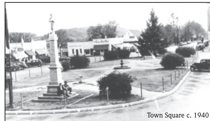
Town Square c. 1940