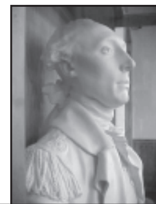
This bust of Lafayette is on display at LaFayette City Hall, 207 South Duke Street.